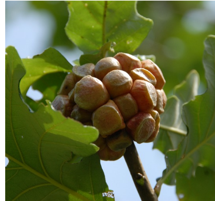
Ohio Woodland Stewards Program