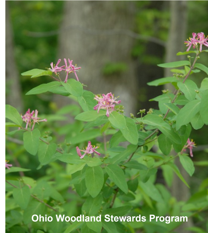
Ohio Woodland Stewards Program